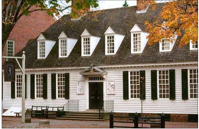
Raleigh Tavern in Williamsburg was established in 1717 and named for Sir Walter Raleigh, who had attempted the first colonization of Virginia in 1585. Phi Beta Kappa was founded here in 1776.