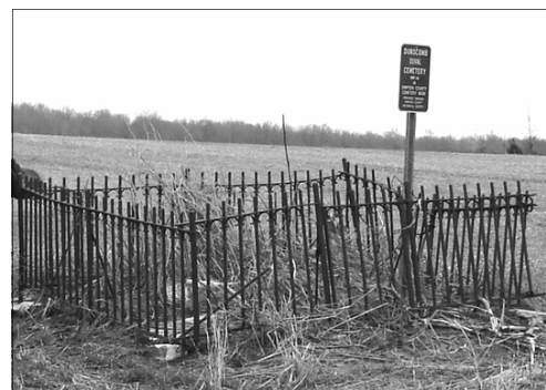
The site as it appeared before restoration began in 2008. The markers had been flattened and broken, and the fence was held together with wire.