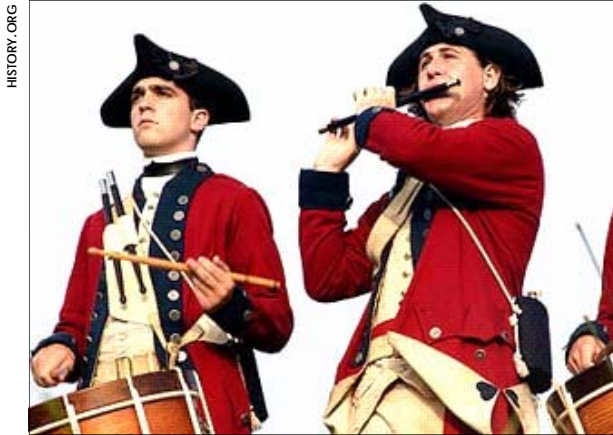
Attired in period costumes, Williamsburg's Fifes and Drums regularly parade through the historic area.