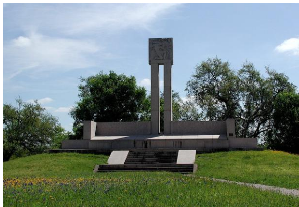
The Battle of Goliad Monument

Remember the Alamo! And The DFA Reunion!