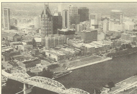
Nashville, also known as "Music City," will be the site of the first DuVal reunion to be held outside Virginia since 1936

The DFA board will hold its annual meeting on Friday morning, leaving cousins who are already in town to see a little of Nashville. In the afternoon, the biennial general-membership meeting of the association will be called to order. Among the items of business on the agenda will be the election of officers and, possibly, the adoption of some amendments to the association's bylaws. Look for the proposed slate of nominees for officers and other board members in the next issue of The DuVal Family News , which you will receive in